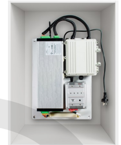
Control Box & Power Supply housed in cabinet

Minimum internal dimensions required for cabinet