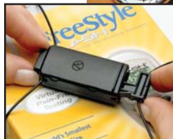
2-Stage Locking Clip for the most secure fit